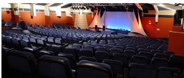
The conference centre is situated in the heart of Aix-en-Provence